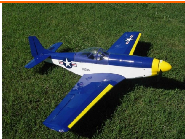
The classic lines of the P51 and great colour scheme.

This is John Roche's newly built P-51 Mustang, which is a Mountain Models balsa & film kit. As the Mustang is notorious for tip stalling, the strong recommendation from the designer was to keep it as light as possible, and consequently the laser-cut balsa components are very thin and very fragile. Some additional strengthening was added, but the GWS retracts omitted to keep it light.