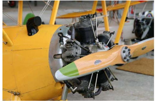
Tons of grunt. 5-cylinder radial 4 stroke with scale prop, fitted to a Stearman biplane.

on the day and the air contained several aircraft all the time. These varied from electric powered right through to fire breathing 5 cylinder gas radials and one jet.