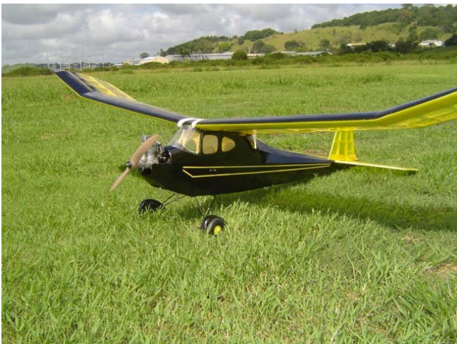
The Buzzard Bombshell with OS 48 four stroke motor.

Another new model at the field is my Buzzard Bombshell old timer. This is another of the early free-flight designs that has been converted to radio. Because of this, its flight behaviour is quite gentle and forgiving and the model is suited to a stress-free, sunny, mild afternoon.