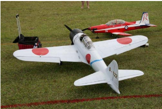
Not just allied planes are modelled. Here a Japanese Zero sits awaiting its next flight.