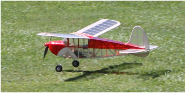
The Chatterbox on approach.