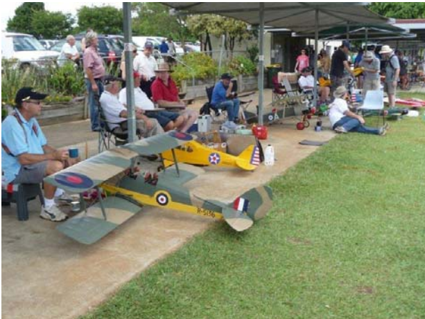
My Tiger Moth in good company at Tingalpa.

It's always a pleasure to attend events at the Tingalpa club in Brisbane. This is one enthusiastic bunch of modellers who are always welcoming and carry a great deal of pride in the clubs facilities.