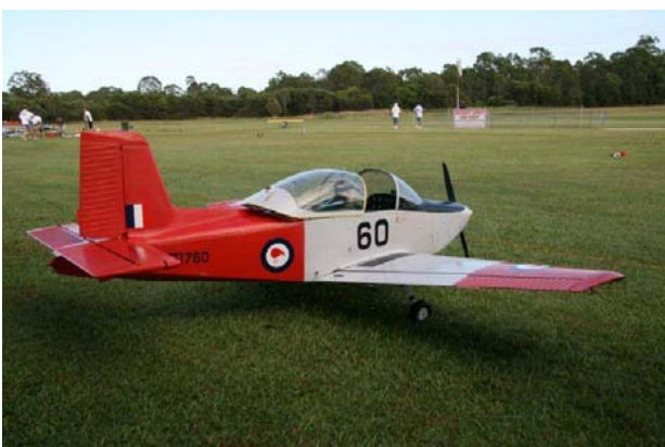
The Victa Airtourer in RAAF training colours.

SCAF is a group of Warbird fans that meet regularly every month at different clubs all over southeast Queensland. As long as you have your Gold Wings and a genuine Warbird aeroplane you are welcome to join this group.