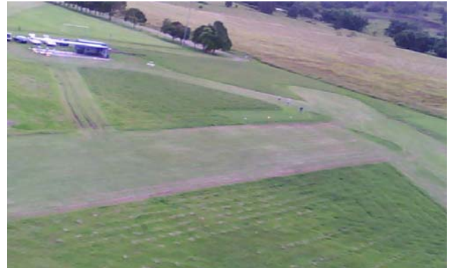
How on earth do we, so often, miss those huge runways?

I did a very, very brief scan of the instructions (downloaded, not supplied) and hurriedly mounted the camera under the wing of one of my electric planes. The resulting video was of reasonable quality with good sound and colour.