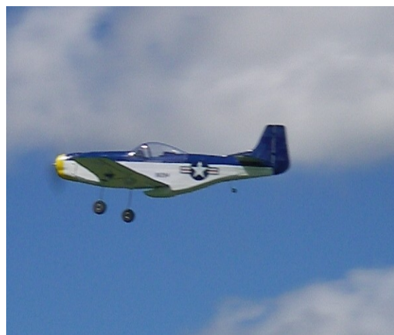
Looking aggressive in flight but quite stable at speed.

Early flights have been successful, but she can exhibit a wicked tip stall and fine-tuning with increased washout and softening the elevator could hopefully limit this. She looks great in the air, flies well except for the slow-speed stall, and has proved herself to be very attractive to a large eagle that was passing by one day.