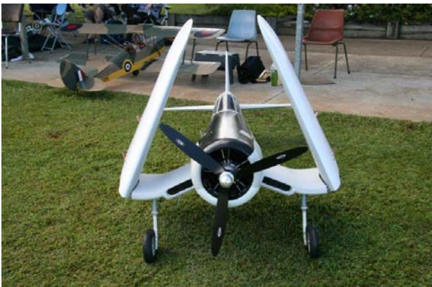
One of the Zero's enemies during the pacific war was the F4U Corsair, shown here with folded wings.