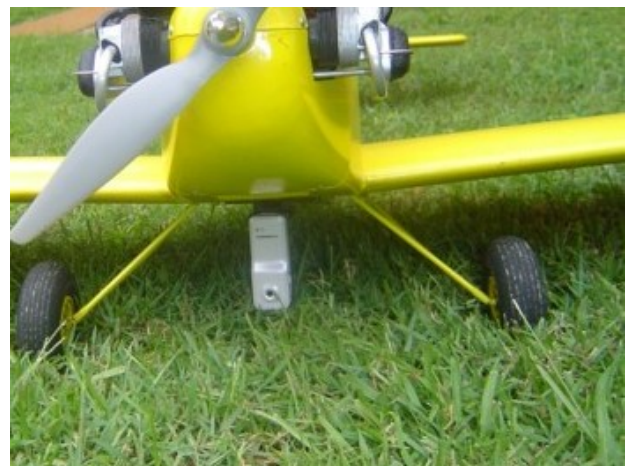
Just enough clearance and, yes, it's upside down!

The claimed 20 minutes of recording is probably correct and I got a good 7 minutes during the flight, and that used around 450meg of the 2gig storage capacity.