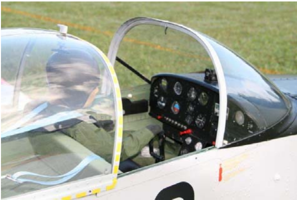
Great attention to detail in the cockpit of the Airtourer.